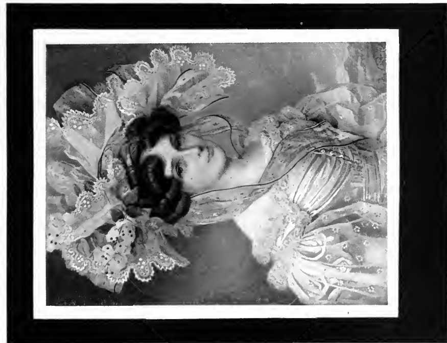
PORTRAIT OF A LADY—NAME UNKNOWN BY EMANUEL PETER